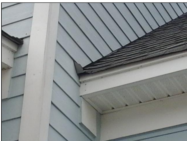
1.1 Item 1(Picture)

1.1 (1) Inspected what flashing was visible.