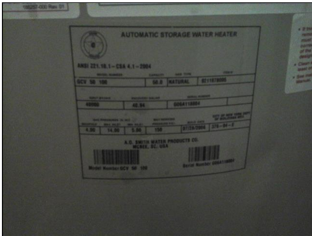
6.2 Item 1(Picture)

6.3 (1) The main shut off is located outside in the ground.