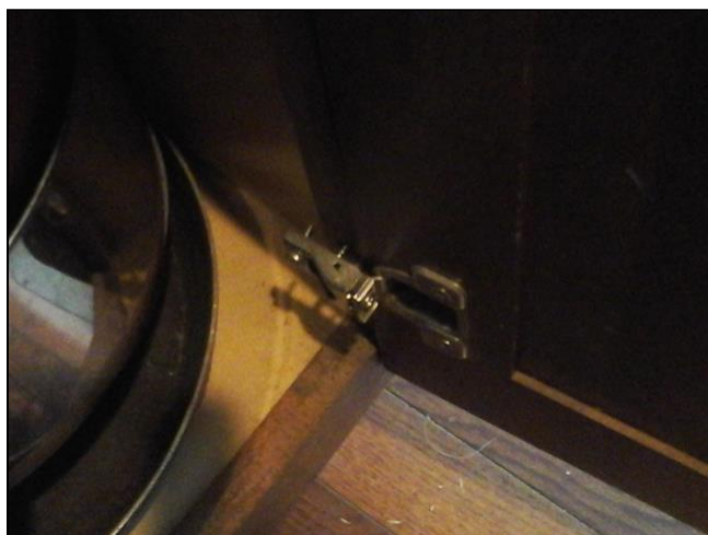
4.4 Item 1(Picture)

(3) Maintenance Item - Cabinet Hardware very loose in spots. Recommend repair or replace.